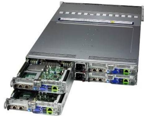
Fig. 3 BigTwin SuperServer SYS-621BT-HNC8R