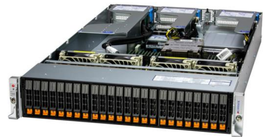
Fig. 3 Hyper A+ Server AS -2115HS-TNR