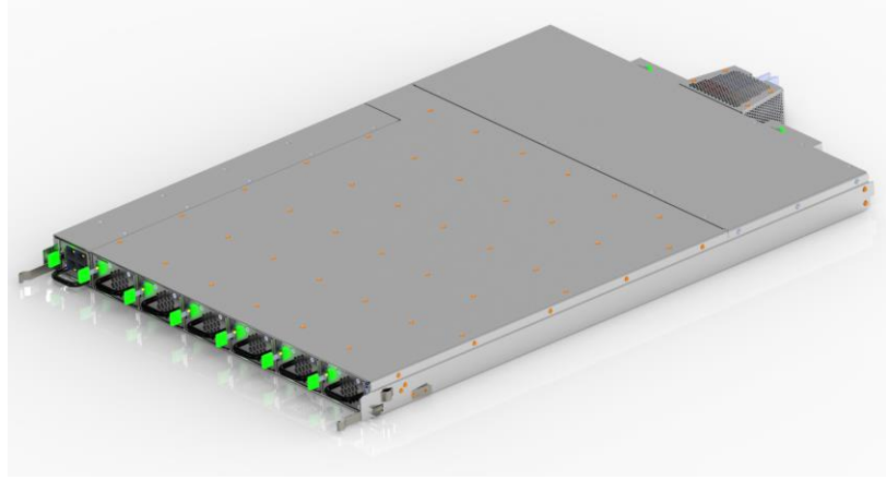
Figure 2 - Power Shelf

• Industry Standards: Supermicro is committed to supporting open industry standards, including EDSFF E1.S and E3.S storage drives, Data Center Modular Hardware System (DC-MHS) architectures, OCP 3.0-compliant Advanced IO module (AIOM) cards for up to 400 Gbps bandwidth based on PCIe 5.0, OCP Open Accelerator Module Universal Base Board Designs for the GPU complex, Open ORV3-compliant DC-powered rack bus bar, and Open BMC. OCP DC-MHS systems provide interoperability between key data center, edge, and enterprise infrastructure elements by providing consistent interfaces and form factors among modular building blocks. Air and liquid cooling is available for the Supermicro CloudDC (DC-MHS based), Supermicro MGX servers, and other planned server product families. The new servers are designed for AI inferencing, enterprise and cloud scale-out workloads.