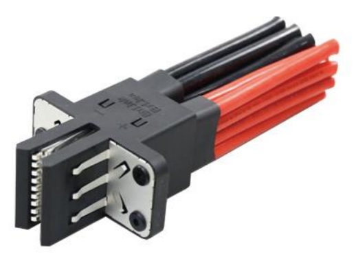
Figure 1 - OCP Open Rack V3 Power Output Connector

• Industry Standards: Supermicro is committed to supporting open industry standards, including EDSFF E1.S and E3.S storage drives, Data Center Modular Hardware System (DC-MHS) architectures, OCP 3.0-compliant Advanced IO module (AIOM) cards for up to 400 Gbps bandwidth based on PCIe 5.0, OCP Open Accelerator Module Universal Base Board Designs for the GPU complex, Open ORV3-compliant DC-powered rack bus bar, and Open BMC. OCP DC-MHS systems provide interoperability between key data center, edge, and enterprise infrastructure elements by providing consistent interfaces and form factors among modular building blocks. Air and liquid cooling is available for the Supermicro CloudDC (DC-MHS based), Supermicro MGX servers, and other planned server product families. The new servers are designed for AI inferencing, enterprise and cloud scale-out workloads.